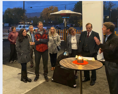
Pro Bono Celebration at The Stil in Boise

After a year of not getting to spend much time in person with friends and colleagues, people were eager to reconnect. So, on a cool October evening, Idaho Volunteer Lawyers was excited to host an event at The Stil in Boise to kick off Pro Bono Celebration Week with the added bonus of honoring the winners of the 2021 6.1 Challenge.